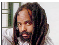
Smerconish: Death penalty in name only