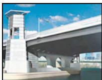
Pressure to re-draw South St. bridge