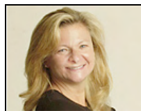
Scottoline: No limit on home improvement